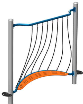
J2 Rope Bridge