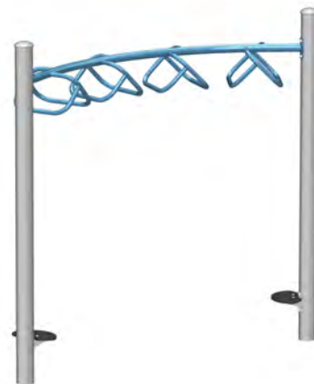
J2 Curved overhead handle ladder