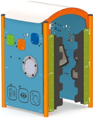
Short Tunnel (L-22000-A and L-22000-B)