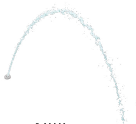
B-20002 Directional spray nozzle