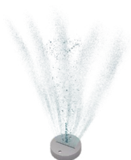
B-20000 Fan spray nozzle