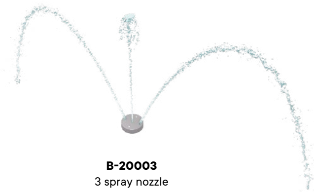
B-20003 3 spray nozzle