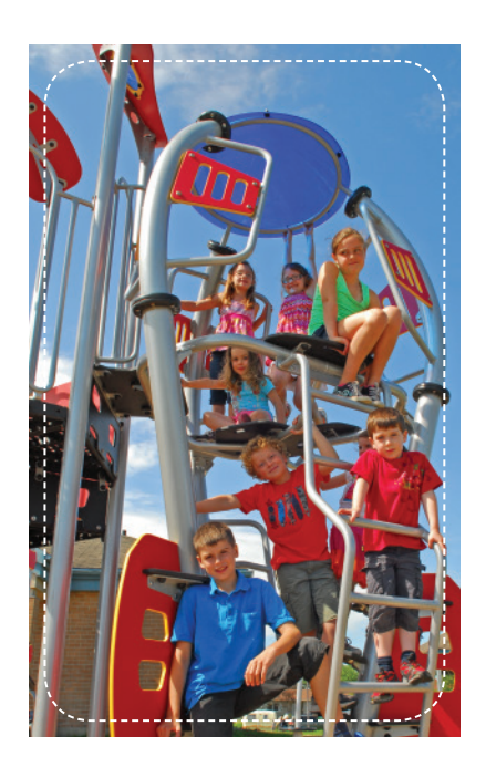
MAKE YOUR OWN THEME? WHY NOT?